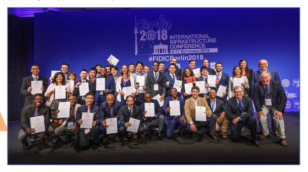
2018 FIDIC Young Professionals Management Training Programme Graduates

The day ended off with presentations given by 35 participants who attended the Young Professionals Management Training Programme. The programme consists of two components: an intensive 7-month virtual learning course followed by a week of in-person working sessions and attendance at the annual conference. To conclude the programme, the teams were given the task of collaborating and presenting an innovation they felt could strengthen the global network of consulting engineers. The solution they presented was an online global knowledge platform to unite the vast knowledge and experience of FIDIC members across the world. The innovation was well received by the audience with FIDIC's leadership promising to support the development of the idea further.