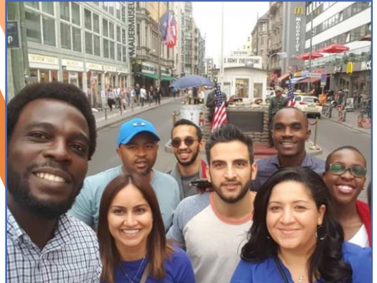
Sight seeing in Berlin

In-between all the sessions, a lot of networking was done, with delegates from a multitude of countries in attendance there was much to learn and share! The conference also arranged several sight-seeing activities and dinner functions for delegates to get a feel of Berlin over a few glasses of local beer — when in Berlin, right! These excursions and networking opportunities afforded us all the opportunity to engage with one another in a more relaxed environment and form personal and business relationships that will hopefully last well into the future. A huge thank you to ACSA and CESA for affording me the opportunity to learn and gain insight to the industry at a global level — the experience has been truly invaluable.