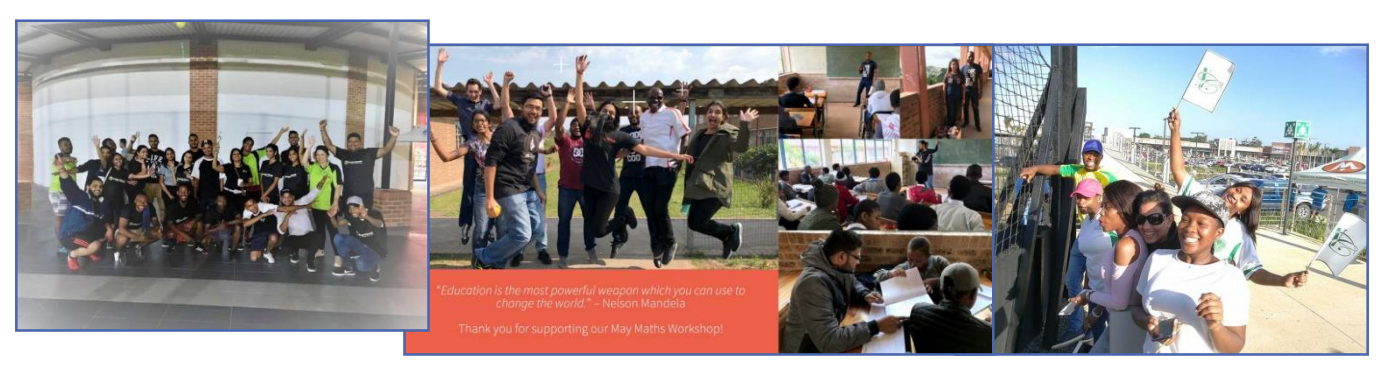
Soccer Tournament teams

This was followed by the Annual CESA Soccer Tournament on the 13<sup>th</sup> April 2018 which has grown in popularity over the past five (5) years, increasing from eight (8) participating member firms to 21 participating member firms resulting in players and supporters being in excess of 300! And for the first time ever, there was a women's tournament. The event was hosted for the first time at the new Action Soccer Venue at the New Cornubia Mall, in Mount Edgecombe. It was an action packed day with 72 games played in total and a thrilling final being contested between Naidu Consulting and RHDHV. Congratulations to RHDHV, who were the ultimate winners thus obtaining the bragging rights for 2018 / 2019. The event as always was well supported, well attended and thoroughly enjoyed by all.